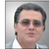
Raffaele Russo Pellegrini Hospital Napoli, Italy

Topic: Triangular Augmentation Cage: A New Solution for Proximal Complex Humeral Fractures