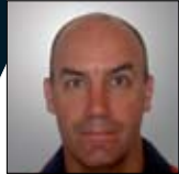
Gerard Bourke Peninsula Private Hospital Melbourne, VIC/Australia