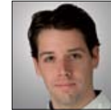
Markus Scheibel Center for Musculoskeletal Surgery Charité-Universitätsmedizin Berlin, Germany

Topic: Triangular Augmentation Cage: A New Solution for Proximal Complex Humeral Fractures